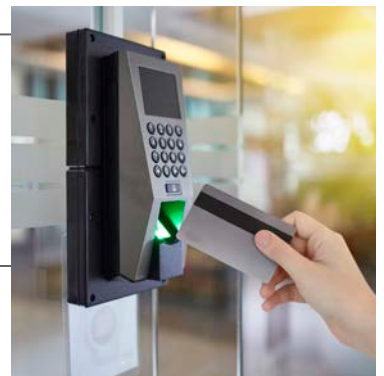
Integrate | Monitor | Control