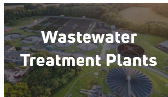
Wastewater Treatment Plants