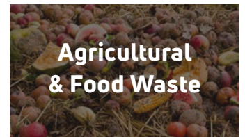
Agricultural & Food Waste